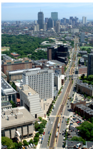
HSPH, 651-677 Huntington Avenue